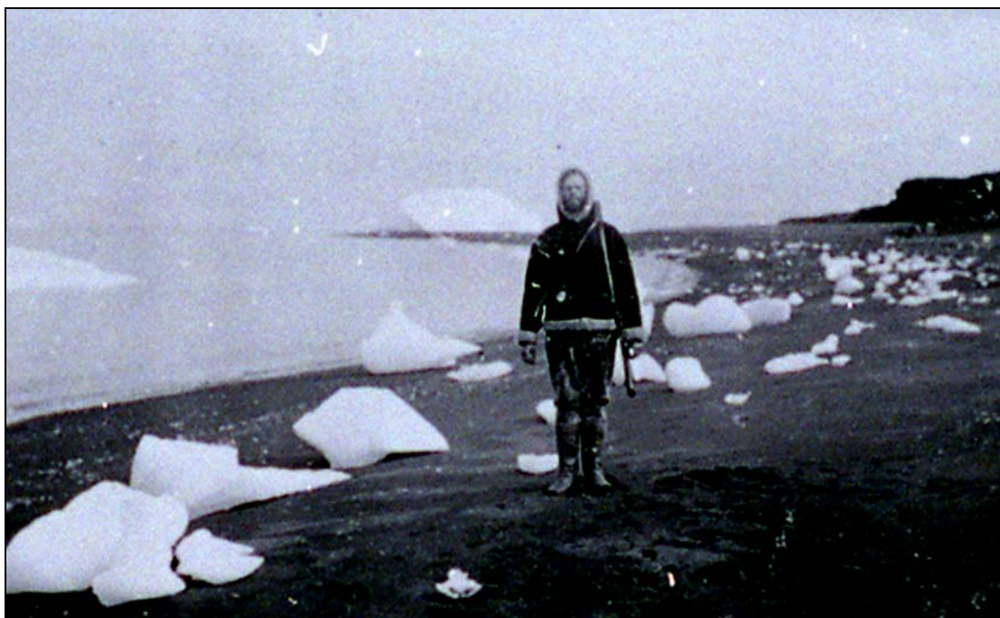
Gästebuch Bd. V